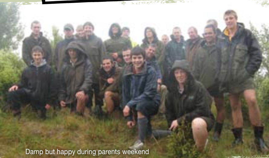
Damp but happy during parents weekend