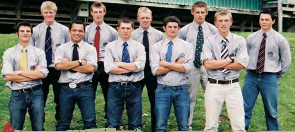
Waipaoa cadets in preparation for the 2010 prize giving.